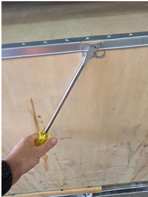
Slide tip of screwdriver under tab,

You may need the hammer to gently tap the tab into a full vertical position before you can remove the panels.