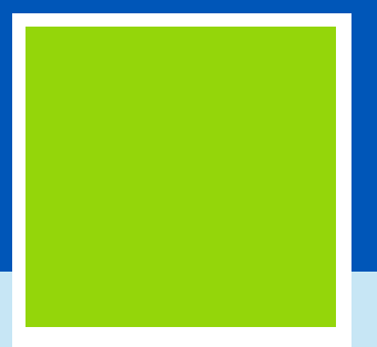
PANTONE 375 C 50, M 0, Y 100, K 0 R 149, G 214, B 0 #94d60a